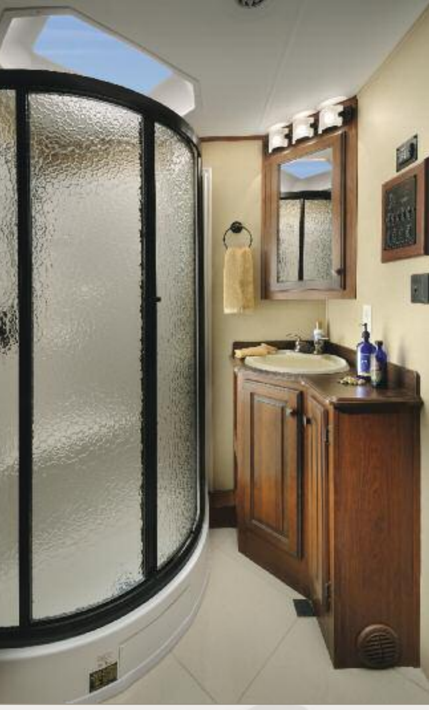
A large textured glass door encloses this radiused shower. Features include bench seating, an adjustable height shower head and a skylight for natural light. Access sliderooms, monitors, batteries, tanks, inverter and lighting controls from the universal coach control center located above the vanity countertop.

Madel 390 FL This bedroom is appointed with elegant fabrics, abundant storage and a standard 24" LCD TV. The large, lighted wardrobe with etched sliding mirrored doors comes equipped with washer/dryer prep. A stackable washer/dryer is available as an option. Sterling decor with Vintage Cherry hardwood shown.