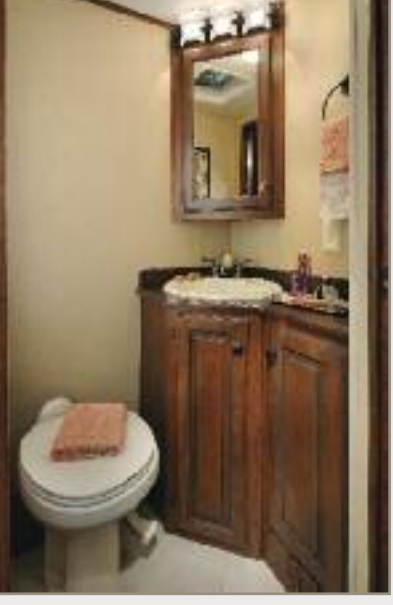
Model 390 RB half bath

Roller style sun and blackout shades throughout the coach enhance privacy.