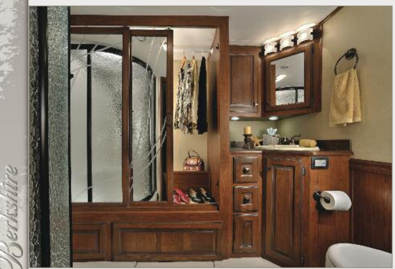
Model 390 RB's luxurious full bath