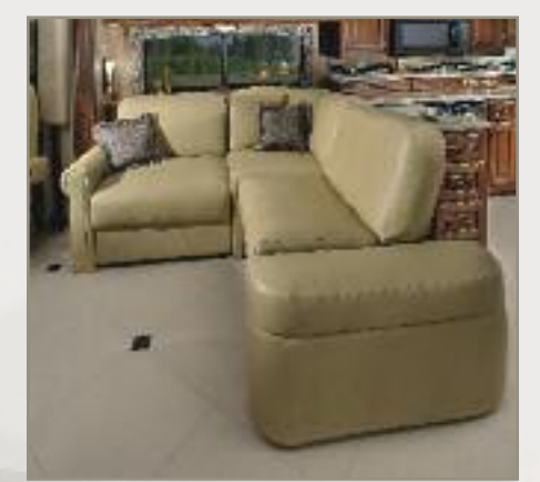
The expandable Ultraleather L-shaped sofa and European style recliner with ottoman are shown in Sterling decor.

Madel 390 \mathcal{FL} Creative cooks appreciate the ample storage and workspace in Berkshire's large, well-appointed kitchen. With solid surface countertops, sink and stove covers, plus an additional pull-out counter extension there's plenty of room for gourmet cooking. From the handy tiered storage on the counter, to the large drawers below for pots and pans, there's a place for everything – even dedicated storage for the sink and stove top covers! A sealed three-burner cooktop with a front high-output burner and a convection/microwave handle large meals. An oil rubbed bronze high-rise faucet, matching kitchen hardware and a tile backsplash complete the residential styling.